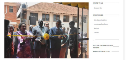
August 20 th February 2024 The Minister of Health, Dr. Jane Ruth Aceng (center) has today officially opened the new Uga Uganda Medicine Expo 2024 taking place at the USA show grounds, Luton.

In an opening remarks, Dr. Aceng who addressed in the event spoke called upon the exhibitors to invest in local pharmaceutical manufacturing in the African continent. The Government is committed to supporting the development of the pharmaceutical industry in the East. The Government has set a goal to produce 10% of its pharmaceutical needs locally by 2025. We are inviting you to support the government of local manufacturing, she said, adding that there are incentives to support investors involved in local manufacturing of medicine. The Uganda Alliance (UgA) has just formed 100+ a million local manufacturers in Africa that is willing to manufacture vaccines. The Global fund is also willing to pay over 1 billion per kilo ton Africa. Dr. Aceng indicated, adding that she is looking forward to see how such manufacturing pharmaceutical products in the continent.